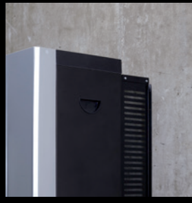
Rear cover kit Tamper-proof rear cover anchors the appliance to the wall and protects plumbing and electrical connections. Ideal for public areas.