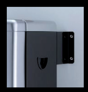
Wall bracket kit For added security, use the wall bracket set to anchor your watercooler back to the wall. Simple to fit and unobtrusive.